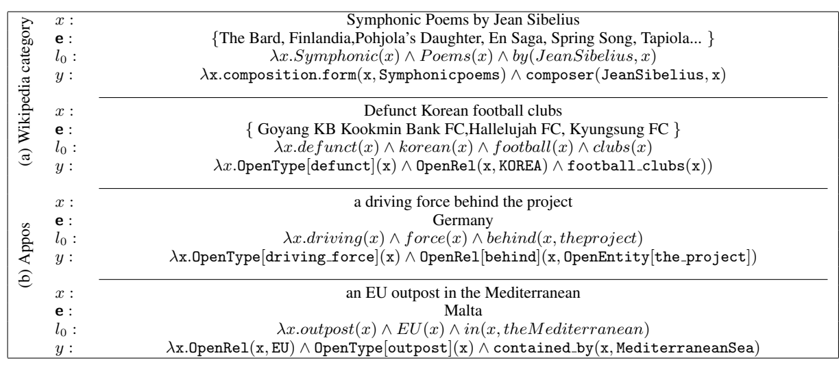
Figure 2: Examples of noun phrases x, from the Wikipedia category and apposition datasets, paired with the set of entities e they describe, their underspecified logical form l_0 , and their final logical form y.

first new dataset contains 365,000 Wikipedia category labels (Figure 1, top), each paired with the list of the associated Wikipedia entity pages. The second has 67,000 noun phrases paired with a single named entity, extracted from the appositive constructions in KBP 2009 newswire text (Figure 1, bottom).<sup>2</sup> This new data is both large scale, and unique in the focus on noun phrases. Noun phrases contain a number of challenging compositional phenomena, including implicit relations and nounnoun modifiers (e.g. see Gerber and Chai (2010)).