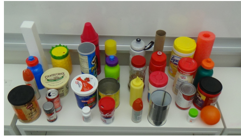
Figure 2: Objects explored via interaction behaviors and for which we have sparse predicate annotations.

In previous work, decisions about a predicate and an object are made for each sensorimotor context (a combination of a behavior and sensory modality) with an SVM using the feature space for that context (Thomason et al., 2016). A summary of sensorimotor contexts is given in Table 1.