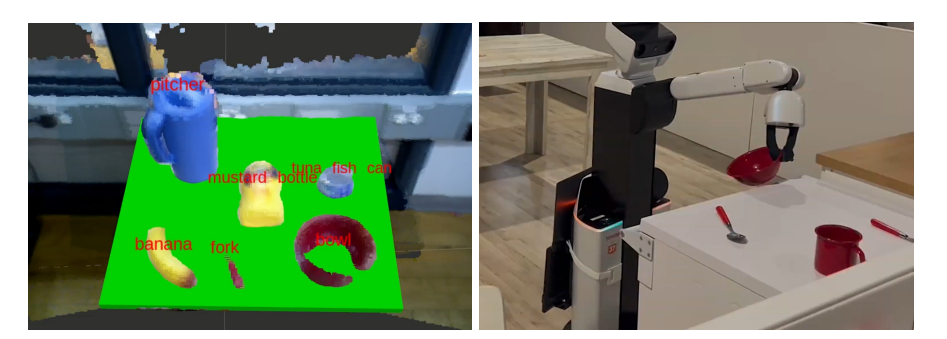
(a) Object and plane detections