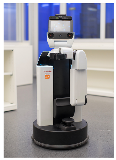
Fig. 4: HSR

Robot software and hardware specification sheet