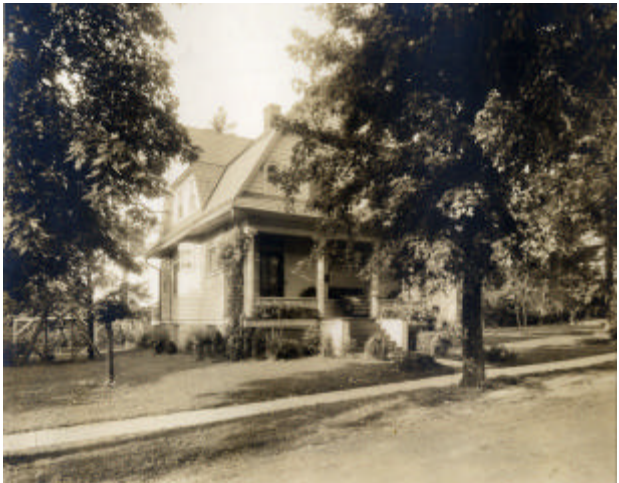
The Kaylor Home on Park Place in Harrisonburg, Virginia—1930