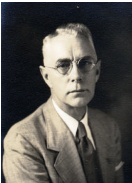
Lupton in 1936