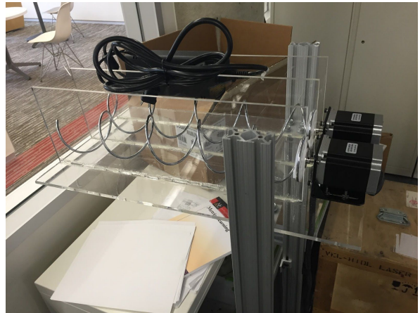
The vending machine, built by students at UT Austin - runs using stepper motors