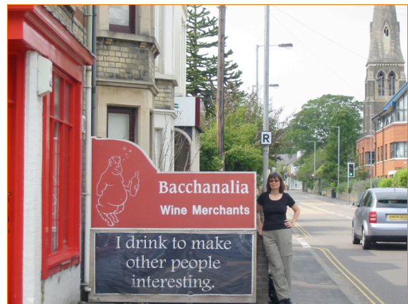
Holly Grasps a Basic Truth About Herself

We wish you the very best that 2010 can bring!