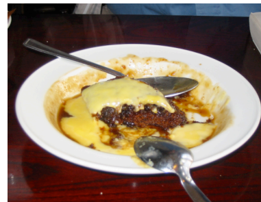
Sticky Toffee Pudding: Our New Religion