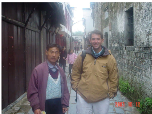
Picture: DSC07493.jpg Title: On the Guxijie Street 1 Notes: The Guxijie Street is one of the longest streets in the Sanhe old town. The first picture shows our tour guide, a local people.