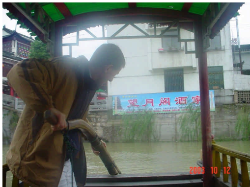
Picture: DSC07492.jpg Title: On a boat in the Xiaonanhe River 3 Notes: We took a boat trip along the Xiaonanhe River. The boat is of a traditional fishing boat style, put forward by wagging a scull, which is laid at the edge of the boat, not by rowing oars.