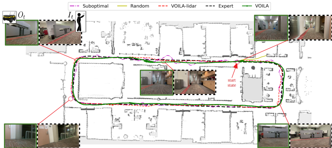
Fig. 1: Policy rollout trajectories of the VOILA agent (green) successfully imitating a demonstration behavior (black) of patrolling a rectangular hallway clockwise. The demonstration consists of a video gathered by a human walking while using a handheld camera that is considerably higher than the robot’s camera (introducing significant viewpoint mismatch). We see that the VOILA agent is able to successfully imitate the expert demonstration even in the presence of this egocentric viewpoint mismatch.

the-shelf keypoint detection algorithms that are themselves designed to be robust to egocentric viewpoint mismatch. This novel reward function is utilized to drive a reinforcement learning procedure that results in navigation policies that imitate the demonstrator.